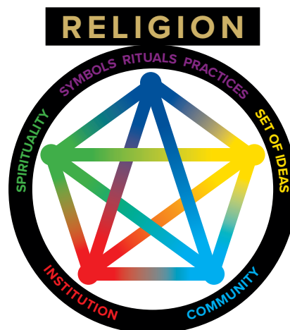
FIGURE 1. Different dimensions of religion relevant to reconciliation